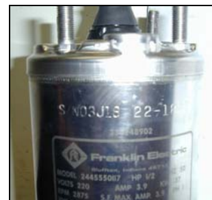
Motor with date codes